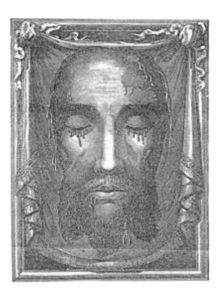
The Holy Face of Jesus